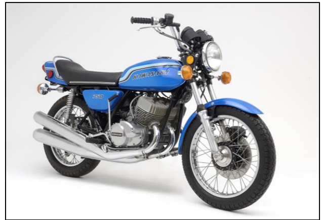
1972 H2 750

Beyond once again blowing the roof off streetbike performance with the H2, Kawasaki sought civility with a roomier cockpit, wider seating, more compliant suspension, reduced vibration and more cornering clearance – all for just $1,395. While much bigger and badder, the H2 was also more refined, a philosophy that would define the four-cylinder, four-stroke Z1 juggernaut the next year.