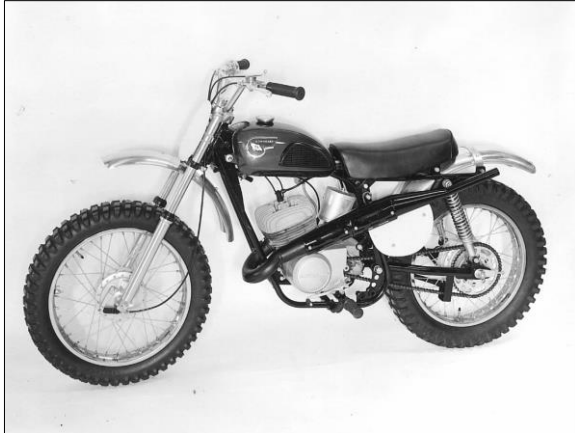
Kawasaki 250cc F21M

After three years of production, the F21M was replaced by the F81M before the revolutionary KX™250 – Kawasaki’s first production motocross bike – arrived for 1974. However, as a result of the 1969 F21M, all Kawasaki motocrossers have been Lime Green ever since, including the current KX250F and the other KX™ models. If you ever find one at a yard sale in Greenville, Greensboro or even Green Acres, grab it. Because the legend of the Green Streak lives!