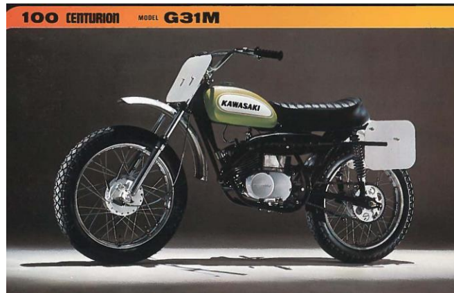
1970 Kawasaki 100 Centurion G31M

With over 4,000 units produced during 1970-71, the Centurion was plentiful enough in its time but is surprisingly rare now, and as such is much appreciated by collectors. Guaranteeing that the Centurion will never slip into obscurity within Kawasaki's heritage, its DNA lives on in the 2016 KX™100 motocross motorcycle, an amazing 46 years after the Centurion's introduction created a new youth market. With the Centurion as part of its history and the launch of the Team Green™ racing team in 1981, the path for Kawasaki and young racers was indelibly set.